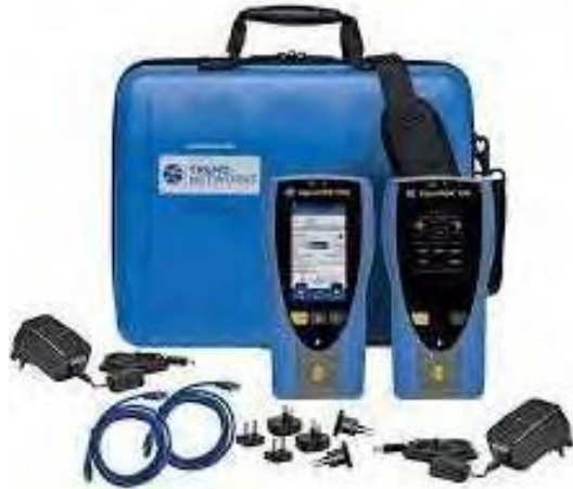
Signal TEK 10 G Series