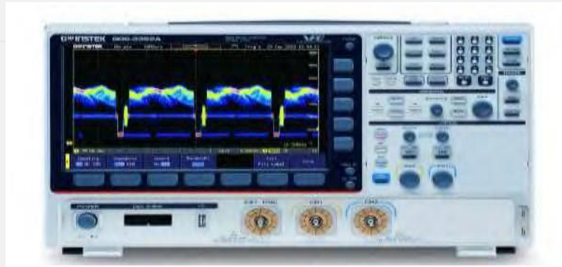
Digital Storage Oscilloscope (Up to 650 MHz)