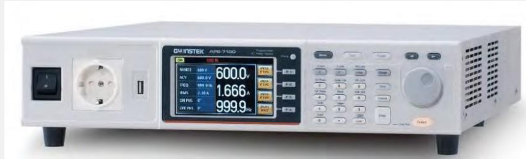
Single and Three Phase Programmable Linear AC Power Source