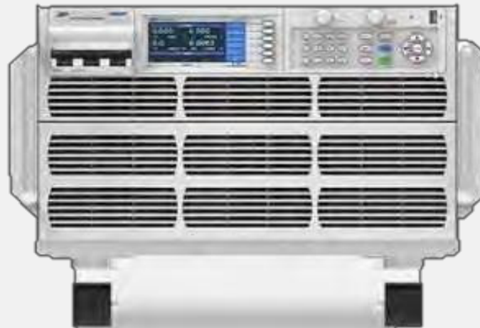
( 6U ) 24000 W ~ 36000W Programmable DC Power Supply