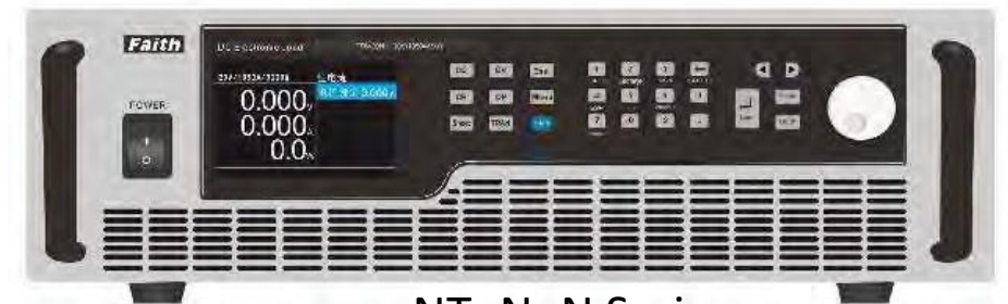
NT -N- N Series Ultra low voltage high current programmable DC electronic load