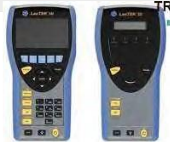
LanTEK III 500 MHz