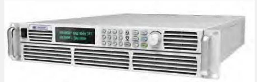
( 2U ) 1000W ~ 40000 W Programmable DC Power Supply