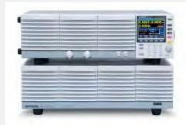
Single and Multi Channel Programmable AC - DC Electronic Loads