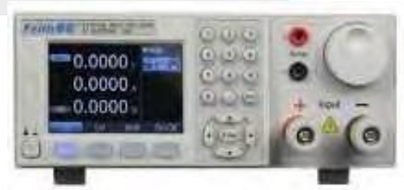
FT6200A series low-power DC electronic load