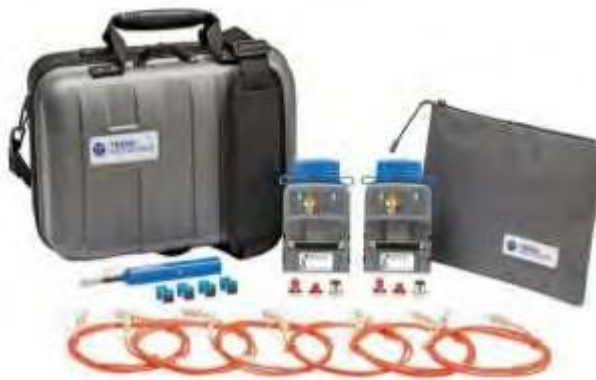
FIBER TEK III -IV