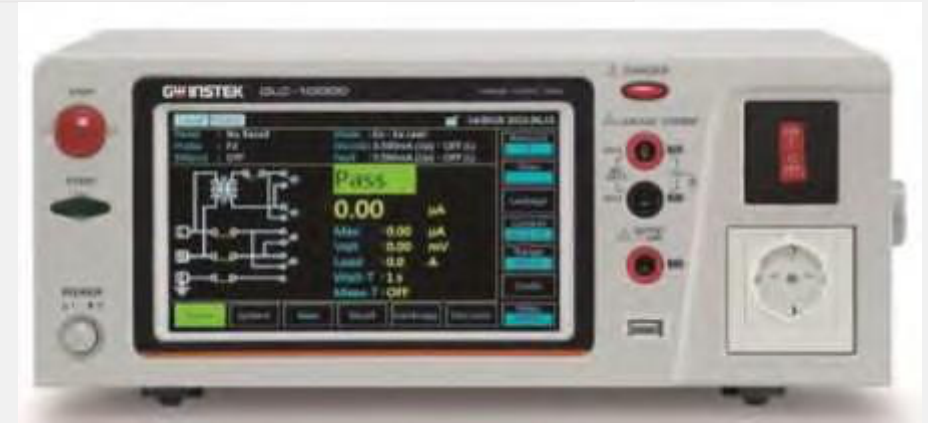
Leakage Current Tester