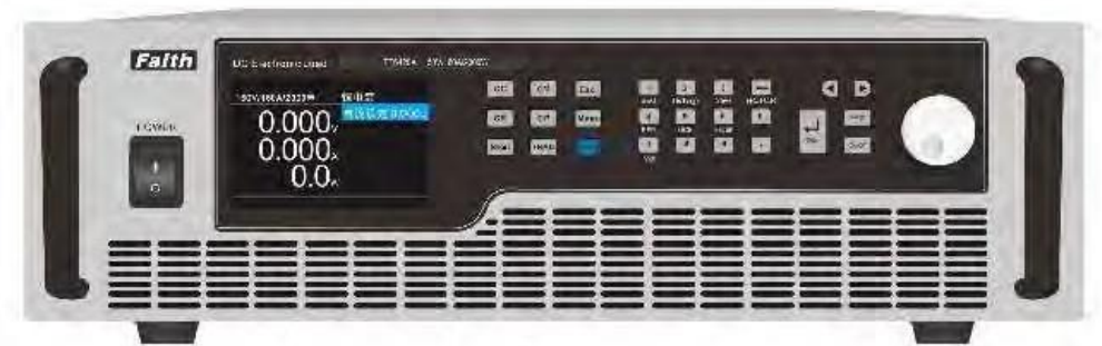
FT6400A series medium-power DC electronic load