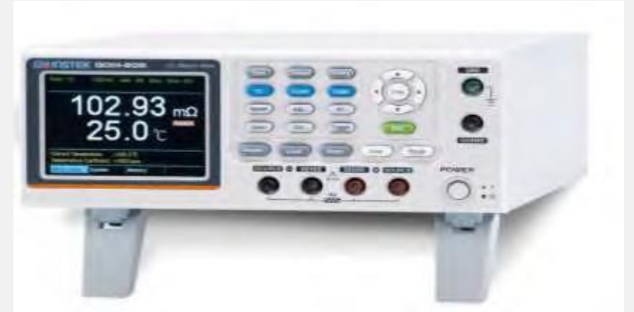
D.C Milliohm Meter