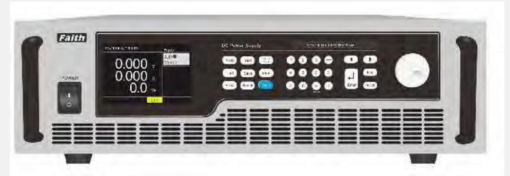
FTG series Modular high-power programmable DC power supply