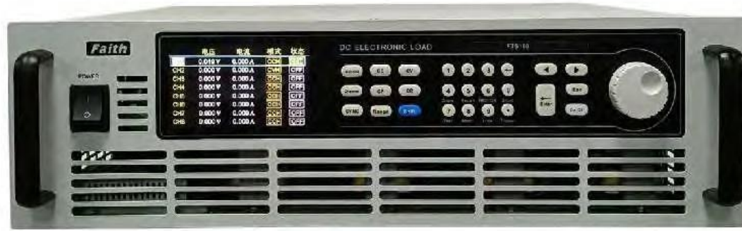
FT6110 series multi-channel DC electronic load