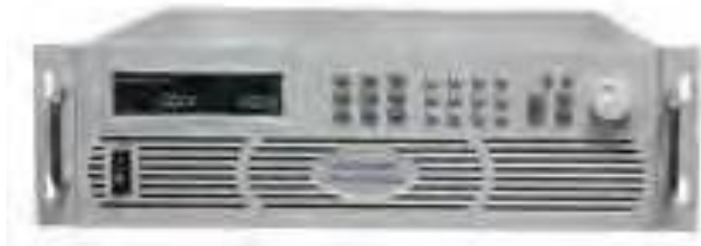
FT6300A series medium and low-power DC electronic load