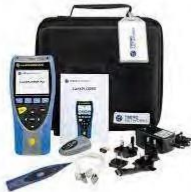
UniPRO MGig 1 -SEL 1