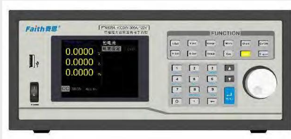
FT6800 series high-power DC electronic load (2.6kW-72kW)