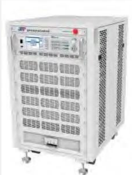
( 17 U ) 6000 W ~ 15000 W AC POWER SUPPLY SYSTEM