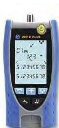
VDV II Series