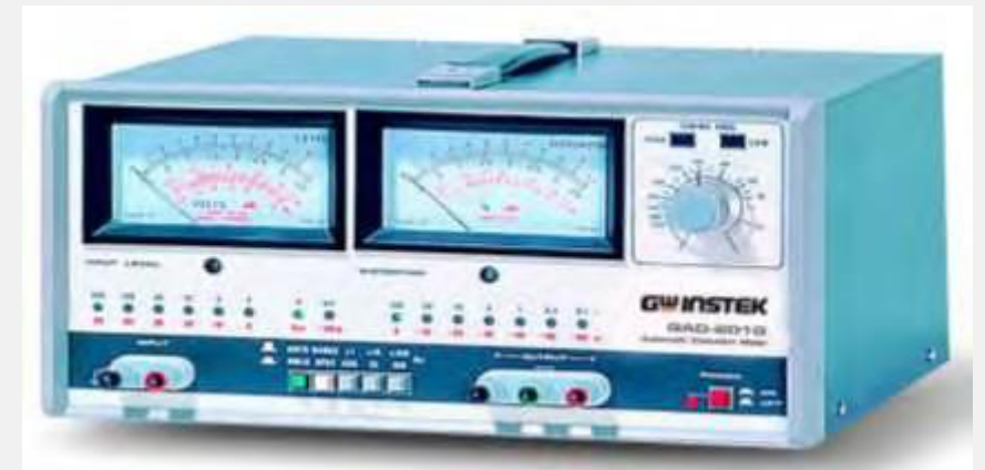
Automatic Distortion Meter