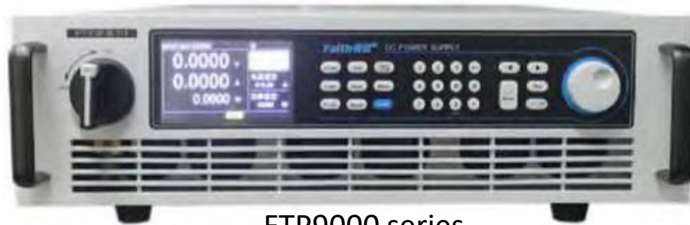
FTP9000 series high-power programmable DC Laboratory power supply