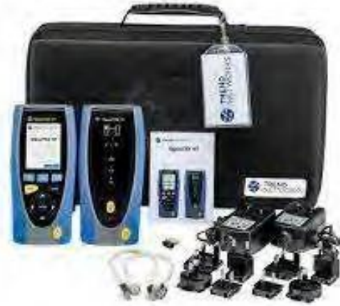
SignalTEK CT - NT