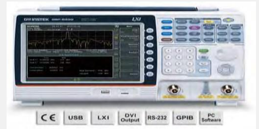
3.25 - 8 GHz Spectrum Analyzer