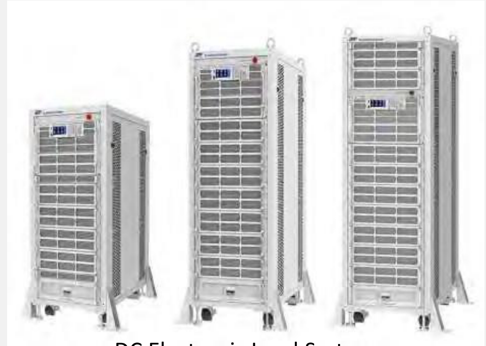
DC Electronic Load System