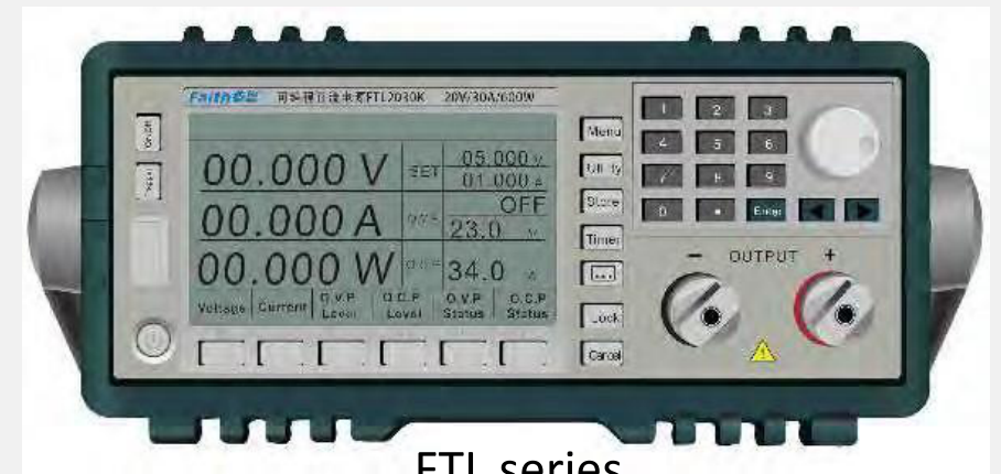
FTL series high precision DC power supply (90W-1500W)