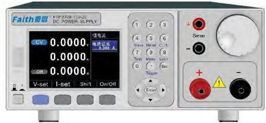
FTP 3000 Series wide range programmable DC power supply