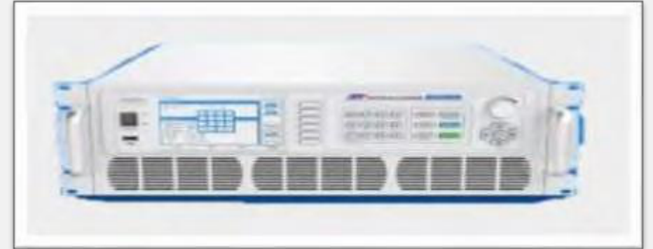
( 4 U ) 3000W ~ 5000W Programmable AC Power Supply