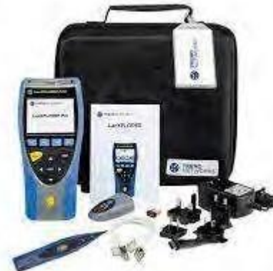
NaviTEK NT Series