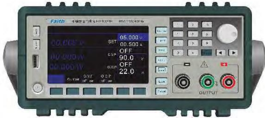
FTL-P series wide range digital-control DC power supply