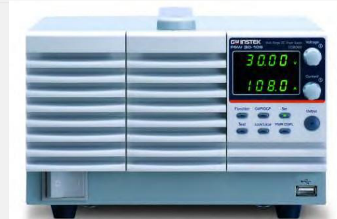
Single and Multi Channel Programmable DC Power Supply