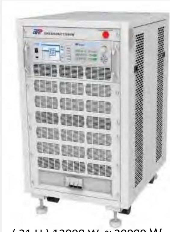
( 21 U ) 12000 W ~ 20000 W Programmable 3 phase ac power supply system