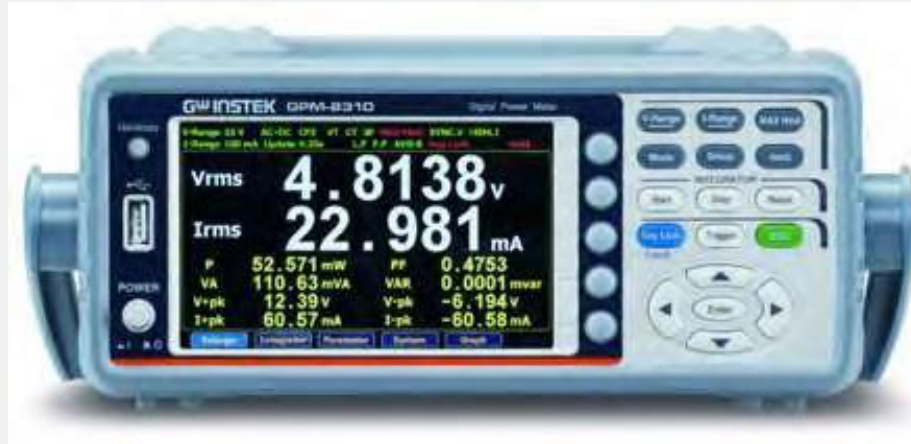
Single and Three Phase Digital Power Meter