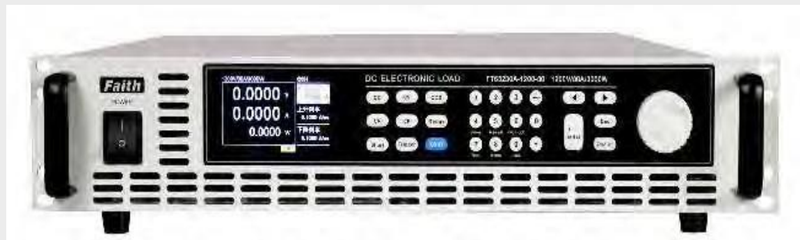
FT63200A-E Medium Power Programmable DC electronic load