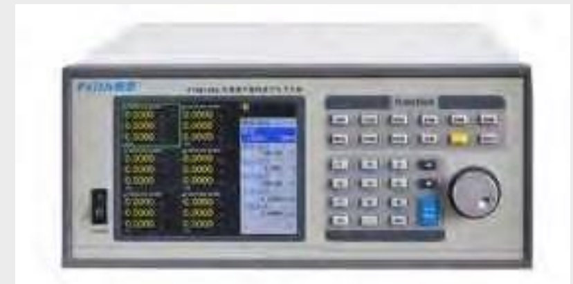
FT66100A multi-channel DC electronic load