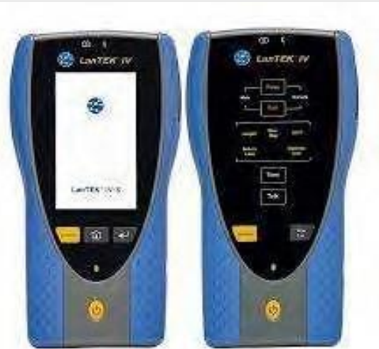
LanTEK IV -S