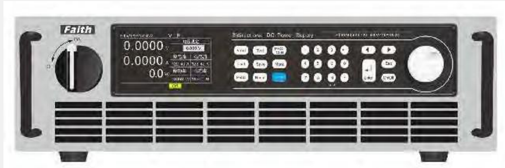
Bidirectional programmable DC power supply