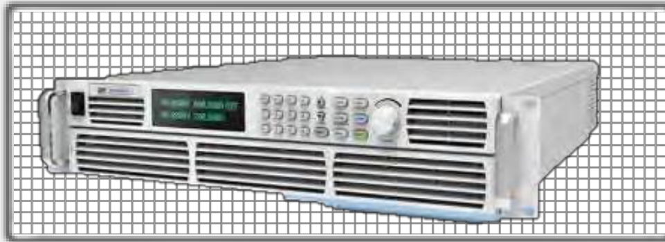
( 1U ) 600 W ~ 1600 W Programmable DC Power Supply