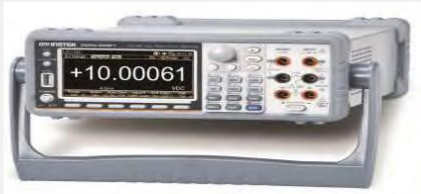
6.5 Digit Dual Measurement Multimeter