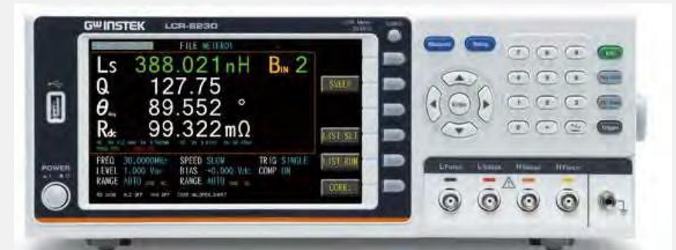
High Frequency LCR Meter