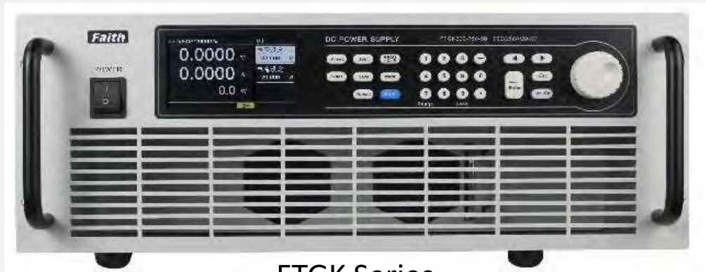
FTGK Series Industrial programmable DC power supply