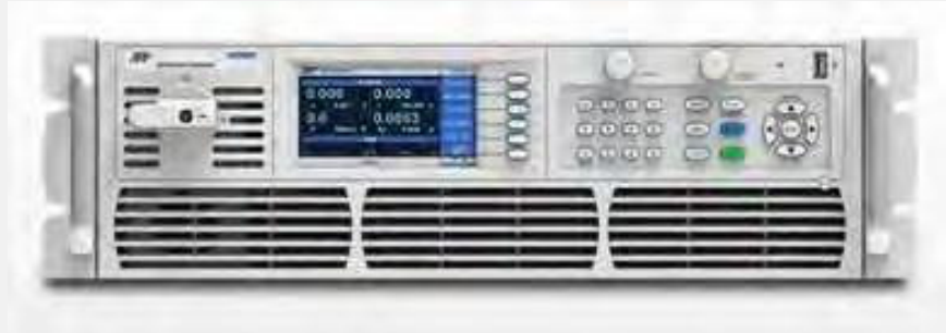
( 3 U ) 6000 W ~ 18000 W High Reliability Programmable DC Power Supply