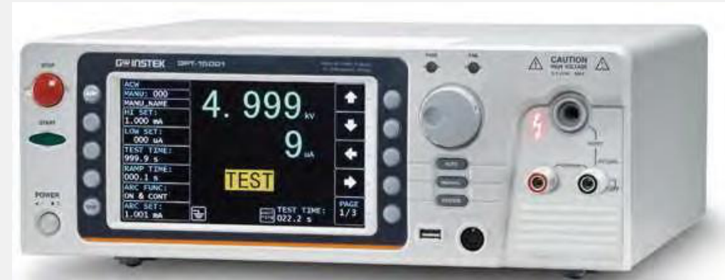
AC / DC / IR / GB Electrical Safety Tester