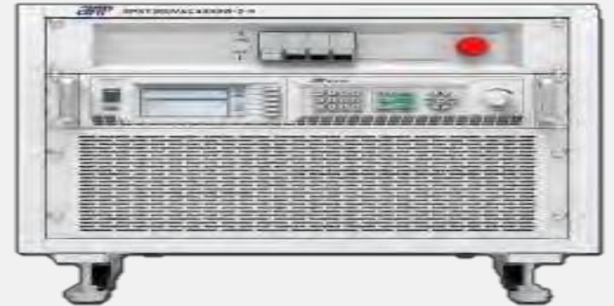
( 9 U ) 1200 W ~ 4500W AC POWER SUPPLY SYSTEMS