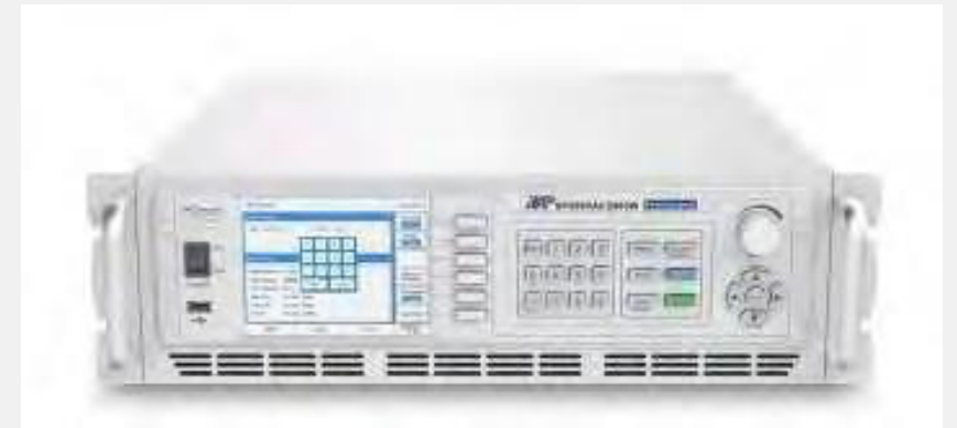
( 3 U ) 2000 W Programmable AC Power Supply