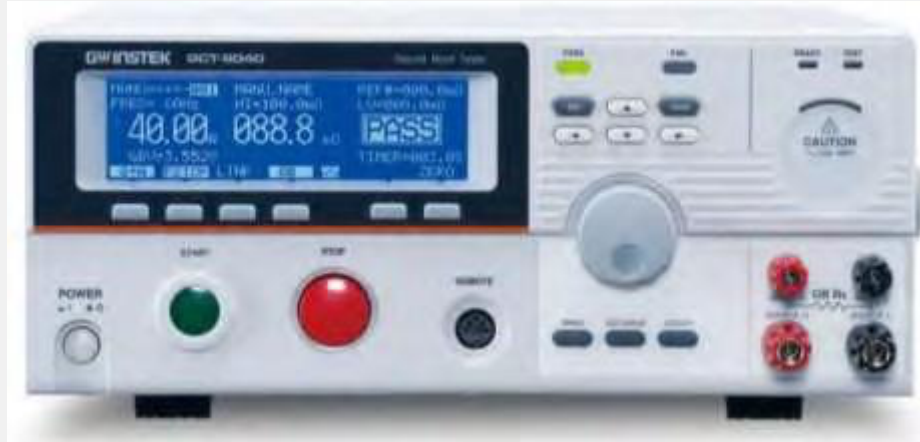
AC Ground Bond Tester (40 Amp)