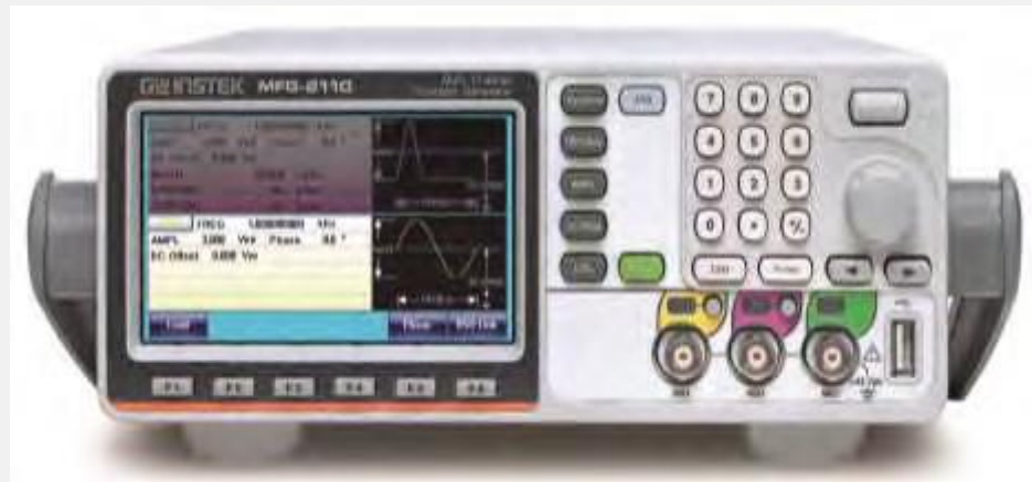
Arbitrary Function Generator (Up to 200 MHz)