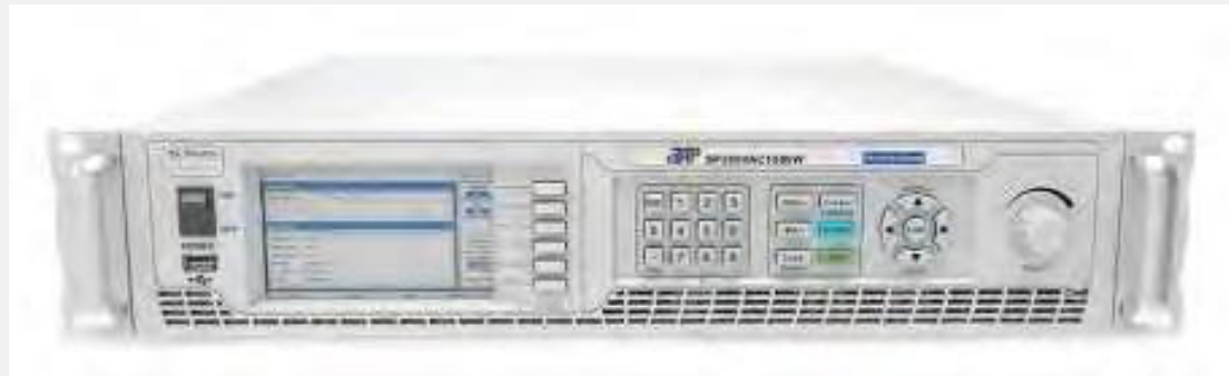
( 2 U ) 600 W ~ 1500 W Single Phase Programmable AC Power Suooly